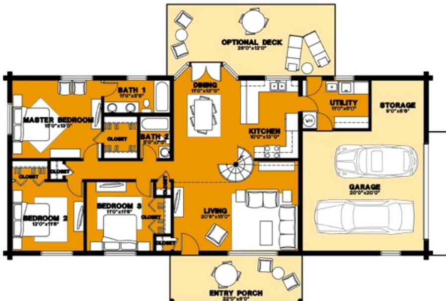
THE HEARTHSTONE MODEL 1ST FLOOR PLAN TOTAL LIVABLE 1596 SQ.FT. GARAGE 624 SQ.FT. PORCHES 176 SQ.FT.