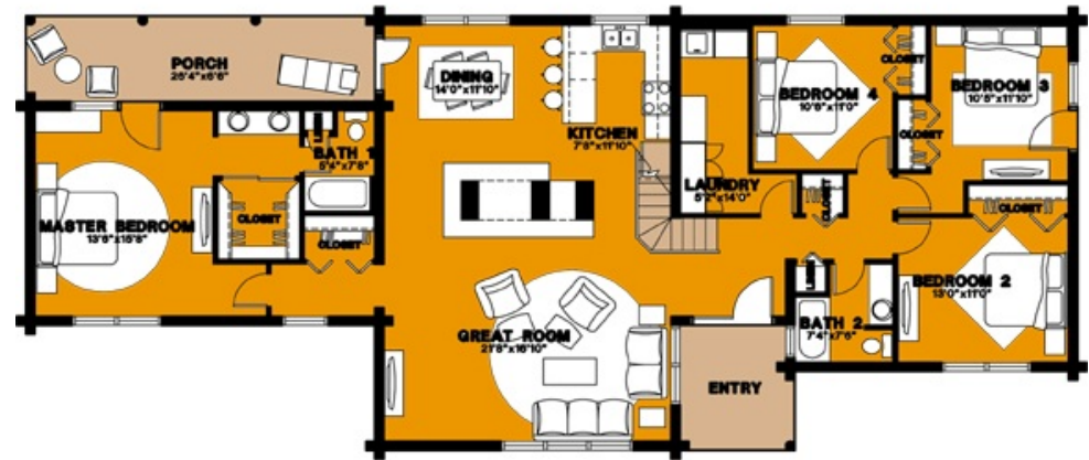
THE PINWOOD MODEL 1ST FLOOR PLAN

1ST FLOOR PLAN 1989 SQ. FT. 2ND FLOOR PLAN 351 SQ. FT. TOTAL LIVABLE 2340 SQ.FT. PORCHES 172 SQ.FT.